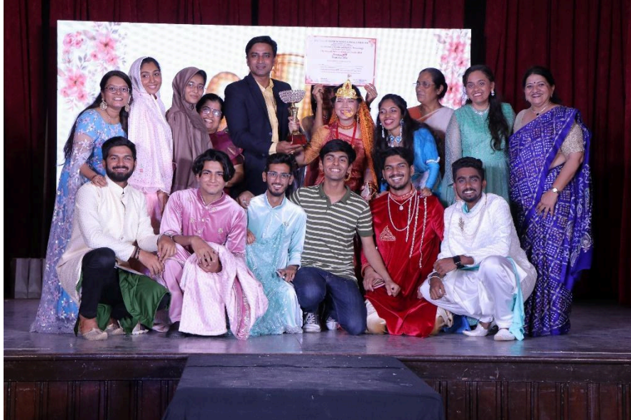
Best Men's Wear Garment by M.Sc. II Sponsored by Vrijesh Corporation