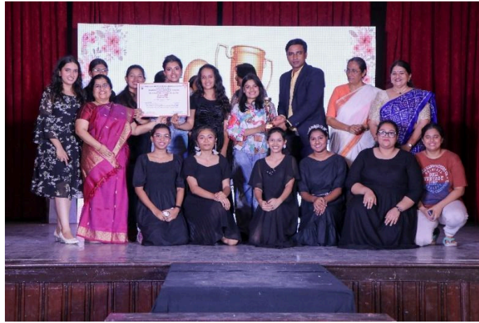
Best Women's Wear Garment at M.Sc. I Sponsored by The Society of Dyers and Colorists