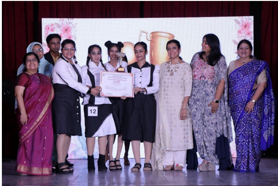
Best Collection at T.Y.B.Sc- Balanced Bliss Sponsored by ZN Skills