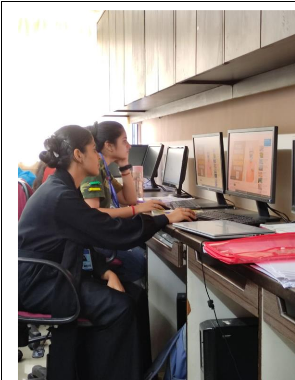
Computer Lab being used for Practical Classes