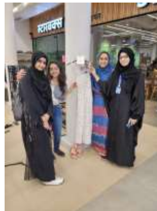
Personal Shopping experience at Zara and Westside