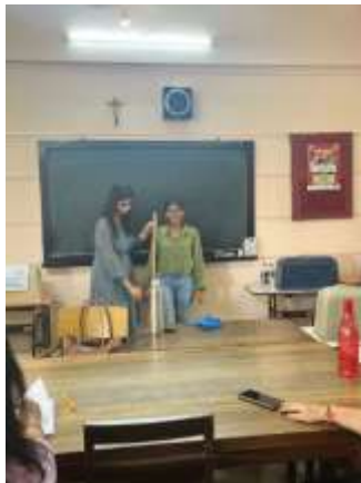
Offline Sessions on Body Types