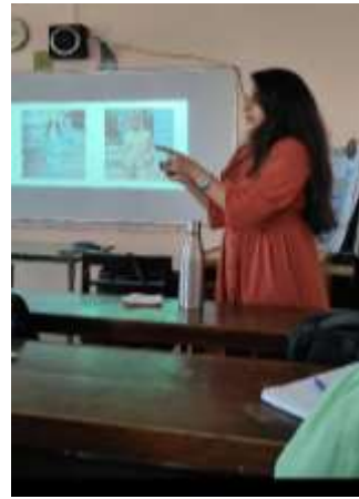
Offline Sessions on Styling