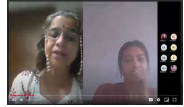
Online Sessions Interaction with students for Project/Practical