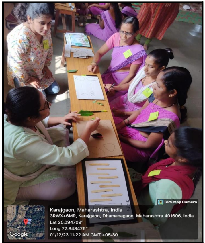
Fig: 3,4 -Teachers making teaching aids at different stations