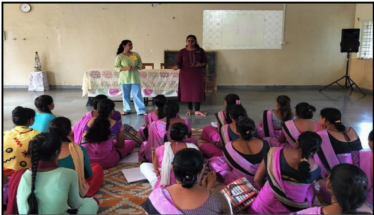
Fig:2 - Day 1 - Teacher Training Workshop