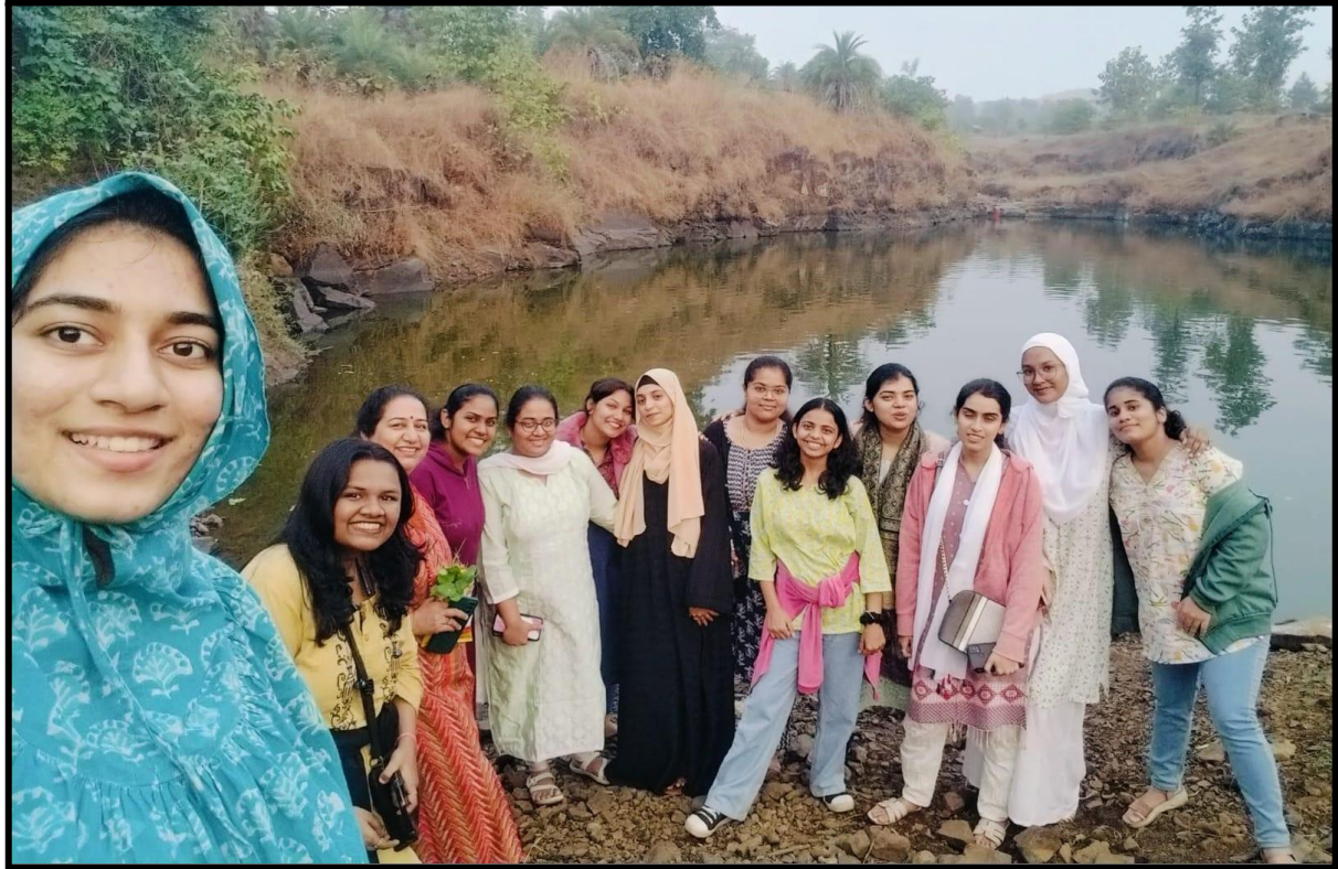
Fig:9 - Visit to the lake in the evening