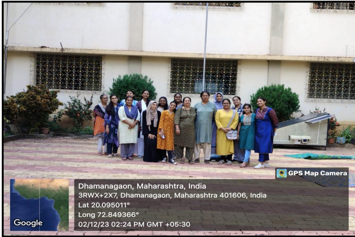
Fig: 16 - End of the Program with a great experience