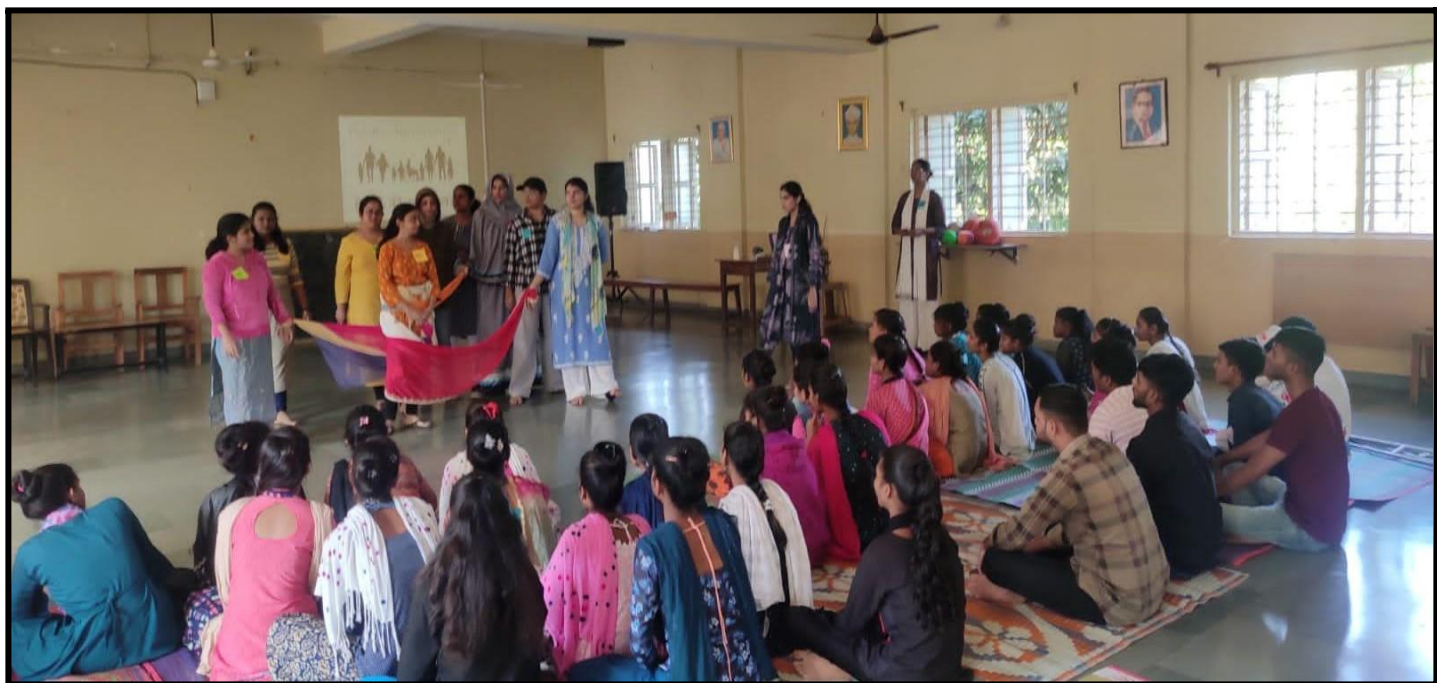
Fig:14 - Skit performed for better understanding of concepts