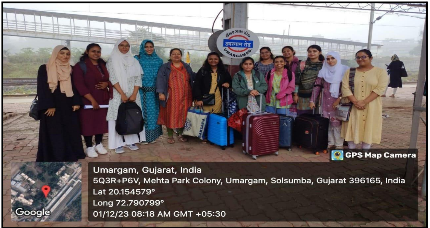
Fig:1 Reached Umargam Station on 01st of December 2023