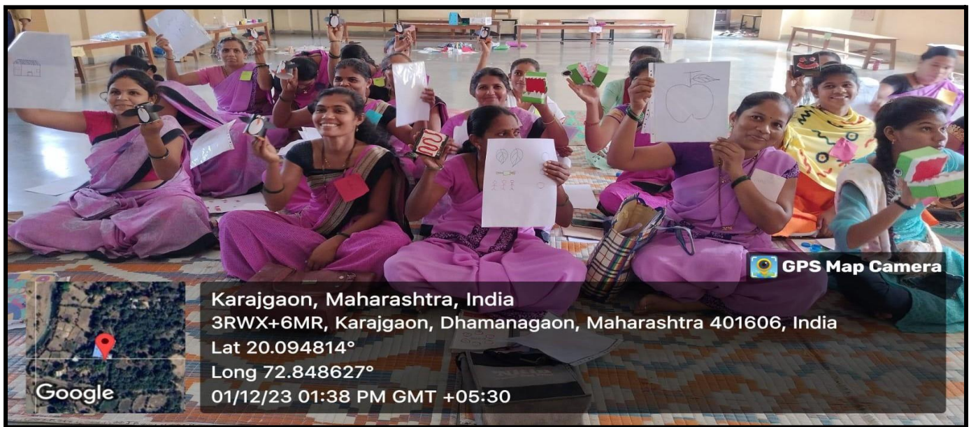
Fig: 5 - Teachers showing the things they made in the workshop