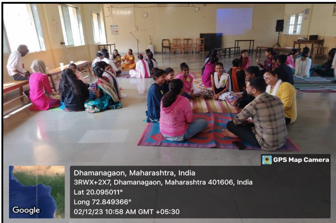
Fig:13 - Participants engaging in activities