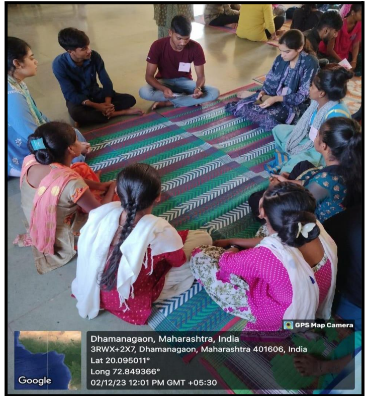
Fig:11,12 - Day 2 – Youth Workshop