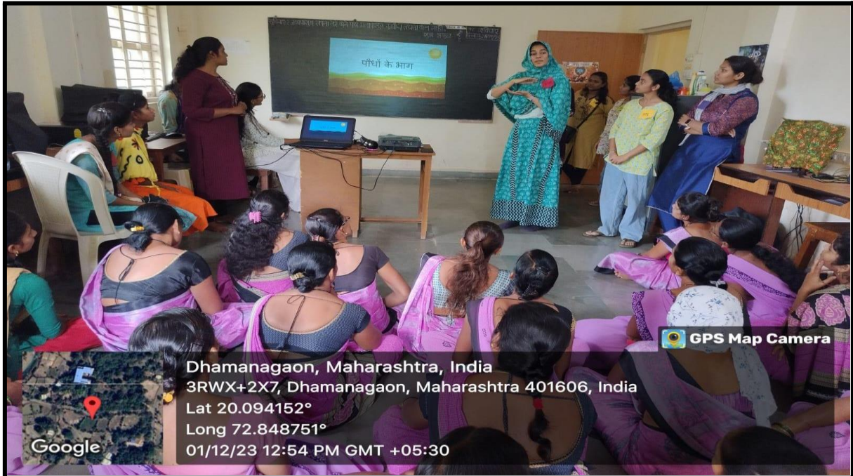
Fig:7 - Teachers were taught to use technology as a medium for teaching