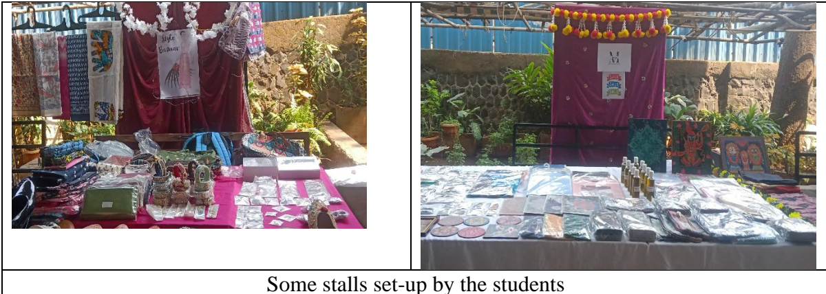
Some stalls set-up by the students