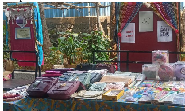
Some stalls set-up by the students