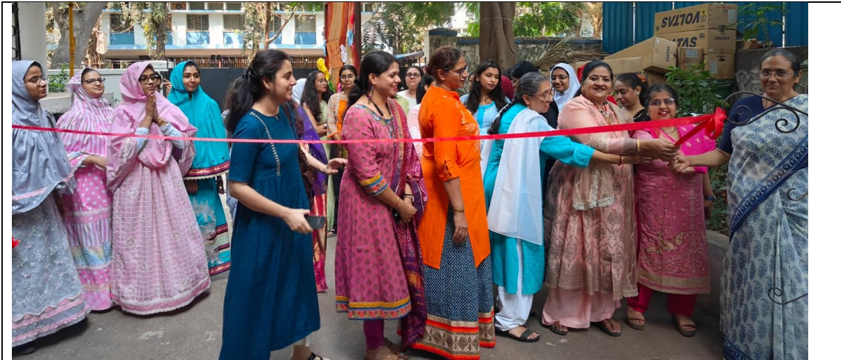
Inauguration of the Jamboree Haat