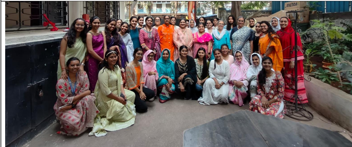
Students of the Department