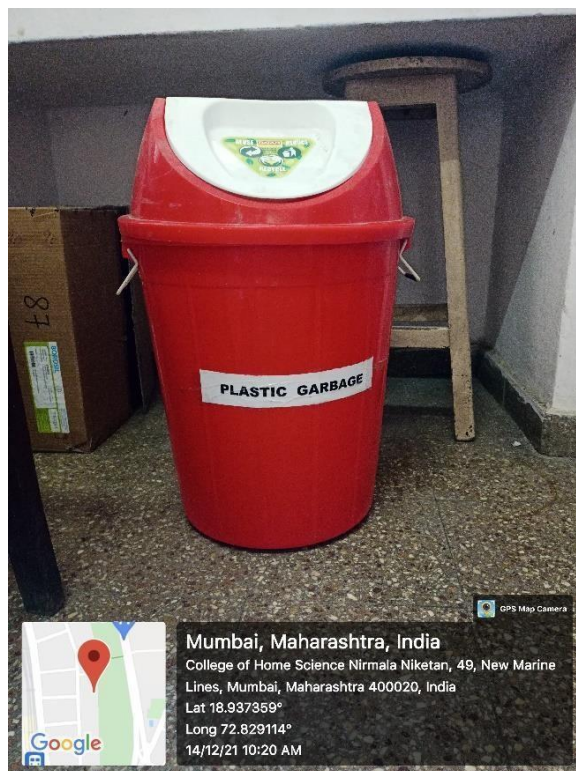
Dustbin for disposal of plastic waste