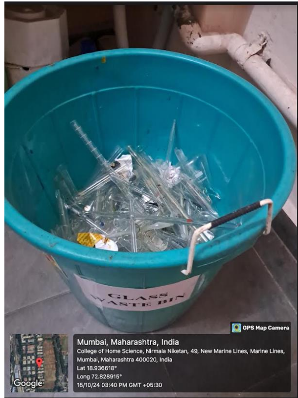
Dustbin for disposal of glass waste