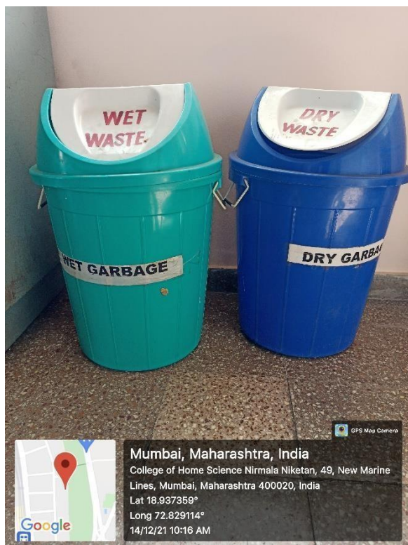
Dustbins for disposal of dry and wet waste