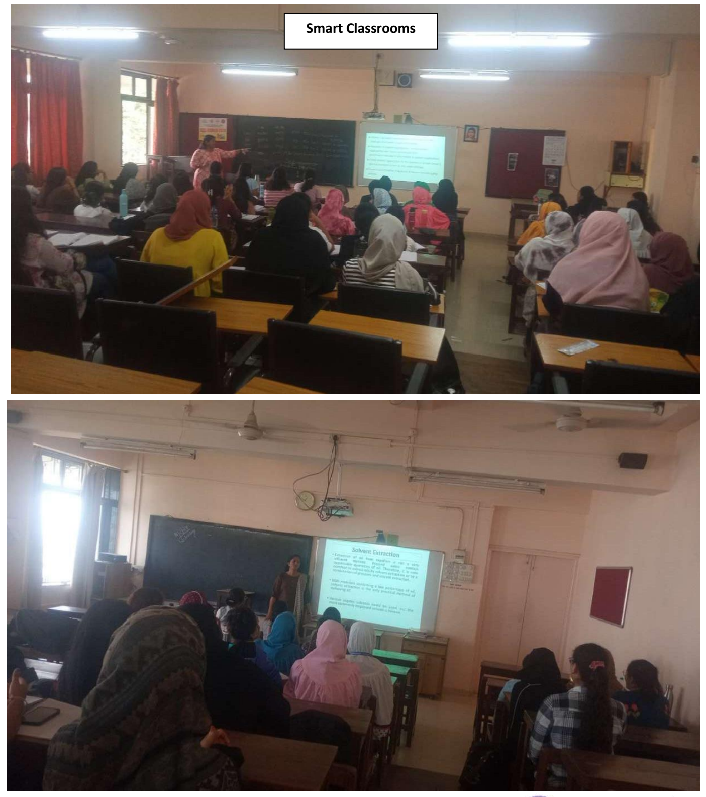
4.1.3 Photographs indicating Classrooms and Seminar Halls with ICT- Enabled Facilities