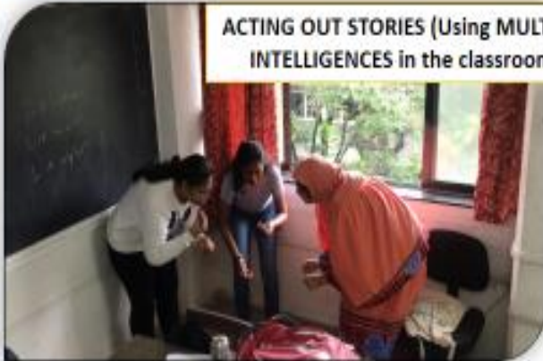
ACTING OUT STORIES (Using MULTIPLE INTELLIGENCES in the classroom)