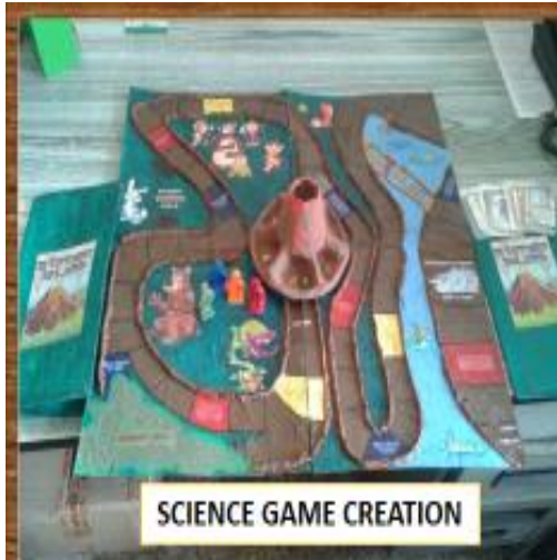
SCIENCE GAME CREATION