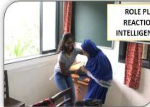
ROLE PLAYING EMOTIONAL REACTIONS(Using MULTIPLE INTELLIGENCES in the classroom)