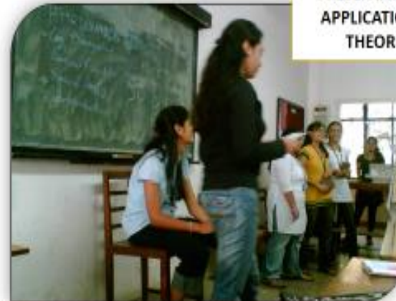
PRESENTATION of APPLICATION OF THEORIES