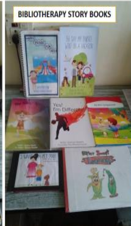
BIBLIOTHERAPY STORY BOOKS