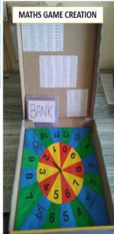
MATHS GAME CREATION