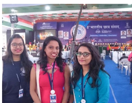
8 TH BHARATIYA CHATTRA SANSAD

Lastly, on the 25th January, 2018; 20 girls from FYBSc and 15 girls from SYBSc attended the inauguration of Madam Bhikaji Rustom Kama Girls Hostel at Sir Cawsjee Jehangir Convocation Hall, University of Mumbai.