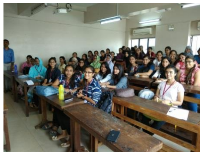
ACCOUNTS KEEPING AND SUBMITTING PURCHASED DOCUMENT SESSION.