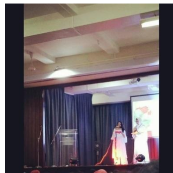
INDEPENDENCE DAY PROGRAM