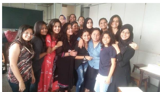
MSC 2 HD INTERACTIVE SESSION

On the 9 th , December 2017; MSc 2 Human Development (HD) organised a welcome/interactive session for the MSc 1 HD on the 6th floor. The session began with a welcome song and dance along with some refreshments. There was an interactive session where they shared their experiences about the college, subjects and their adjustment to a new academic year. Snacks were served simultaneously and it continued with a jam session.