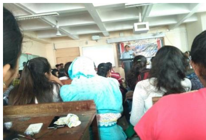
SUBSTANCE ABUSE SESSION