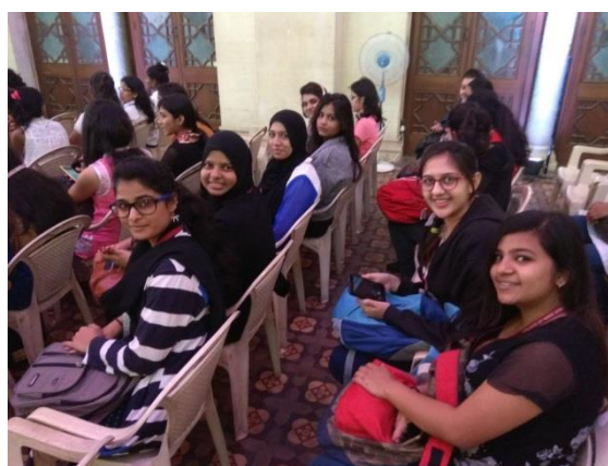
INAUGURATION OF GIRLS HOSTEL