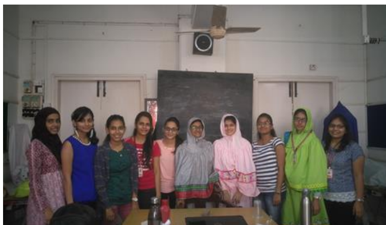
MSC 1 TFT INTERACTIVE SESSION