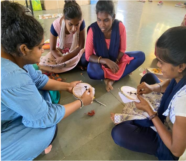
Student Teaching Embroidery to beneficiaries