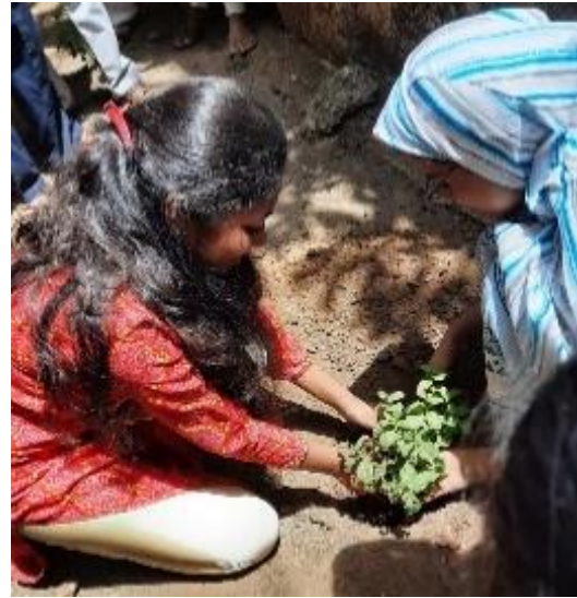
Students planting sapling